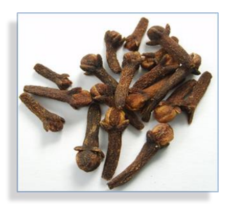
If you cook much, you're familiar with these common lil' guys

Cloves are probably the most antibacterial spices known. Dentists use it very often to numb pain due to infection in patients. It's not that it numbs per say, but immediately begins killing the bacteria in the tooth/gum and therefore it seems like it's a numbing agent. Its "lightning quick" healing that is actually occurring for the patient in all reality and few dentists know this fact.