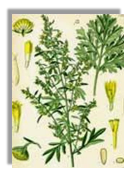
Typical types of wormwood stems, leaves, & flowers

A Shrub-like perennial, wormwood is usually 2-4 feet high with grey-green leaves and yellow flowers. Wormwood grows naturally in arid, uncultivated ground, near roads, fields, footpaths, and in rocky areas. One interesting characteristic of this plant is that its leaves and roots secrete a substance that restricts the growth of surrounding plants, making it a handy natural way to prevent weeds growing around it. It's likely neighbor while growing is usually more of the same growing close next to it!