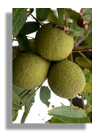
Black walnuts and their green hulls