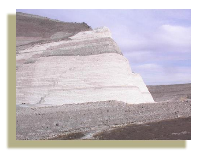
Finally, a huge 14 story high mountain of it.