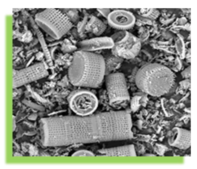
Pic no. 1 Looks like jagged sharp wasteland.