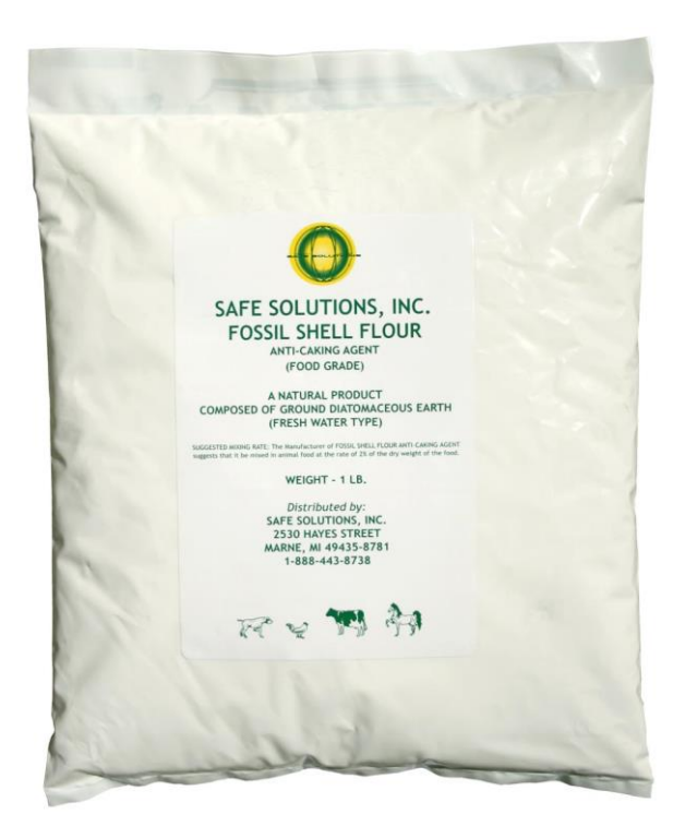
And here is a 1 lb. bag of it.